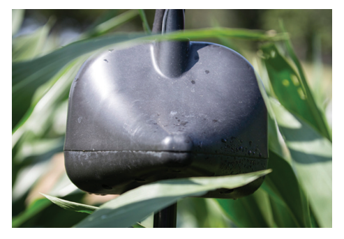
Special shell design protects nozzles and moves smoothly under crop canopy.