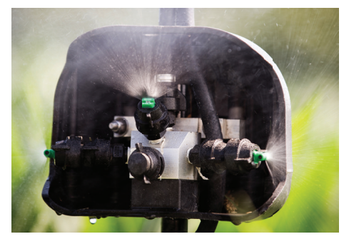
Up to four multi-directional spray nozzles on each unit for customized spray patterns and 150-degree horizontal spray application.